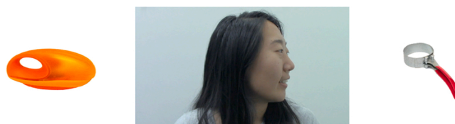
Fig. 1. Example of stimuli used in the learning phase. A speaker turned her head to label each object in sequence. These labeling utterances were embedded in brief, content-neutral discourses about each object (e.g., “I like the shape”).

Children participated in this study from their homes on either a smartphone or tablet, and an experimenter interacted with the child